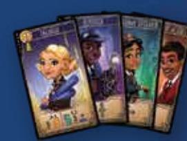
85 Role Cards