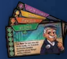
14 Reference Cards