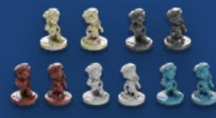
10 Workers (2 x 5 Colors)