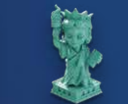
1 Statue of Liberty