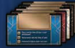
5 Player Color Cards