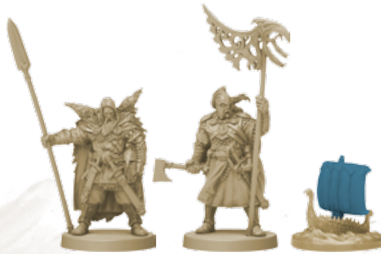
10 RAVEN CLAN FIGURES (8 WARRIORS, 1 LEADER, 1 BOAT)