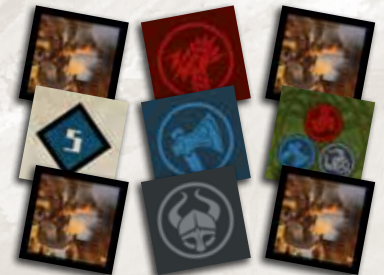
9 PILLAGE TOKENS