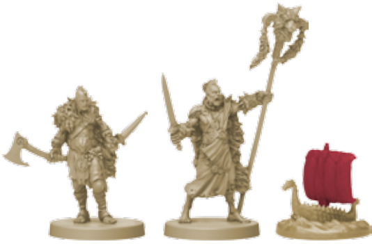
10 WOLF CLAN FIGURES (8 WARRIORS, 1 LEADER, 1 BOAT)