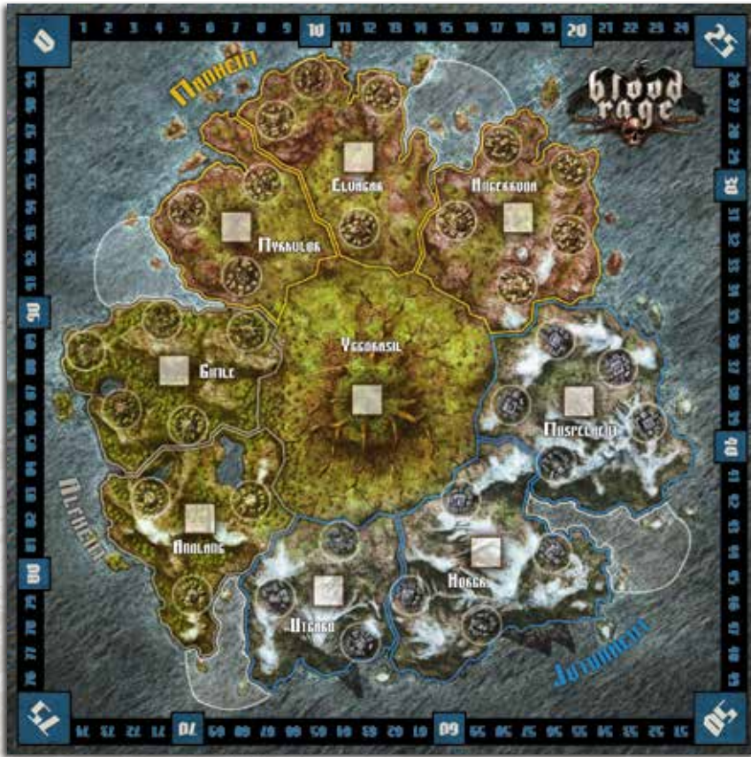
1 GAME BOARD