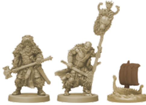
10 BEAR CLAN FIGURES (8 WARRIORS, 1 LEADER, 1 BOAT)