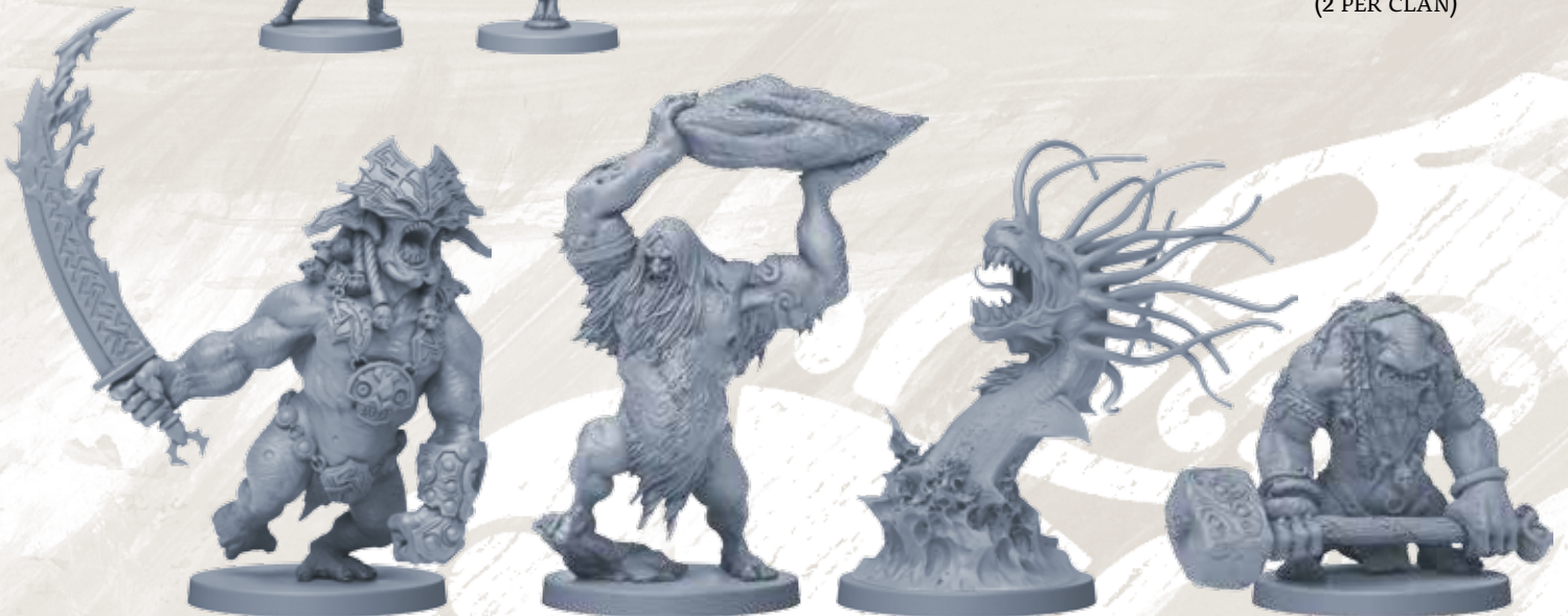
6 MONSTER FIGURES