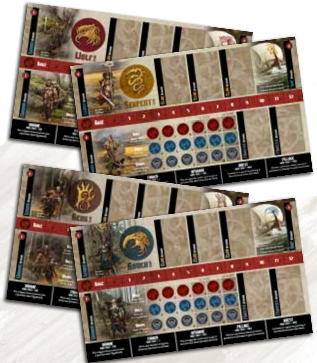
4 CLAN SHEETS