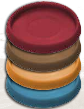
8 LARGE PLASTIC BASES (2 PER CLAN)