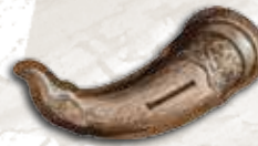
1 FIRST PLAYER TOKEN