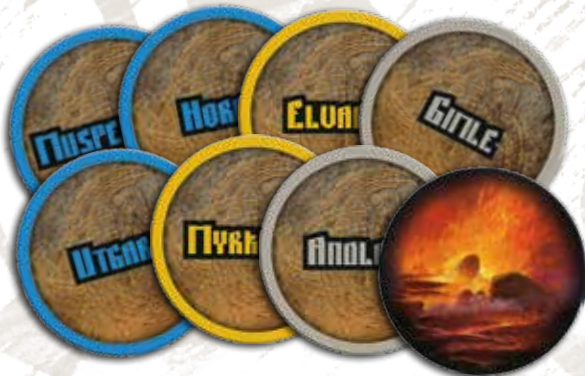
8 RAGNARÖK TOKENS