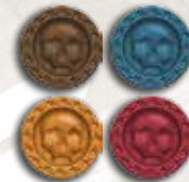
4 GLORY MARKERS (1 PER CLAN)