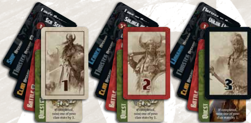
99 CARDS (3 DECKS OF 33)