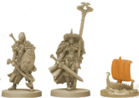
10 SERPENT CLAN FIGURES (8 WARRIORS, 1 LEADER, 1 BOAT)