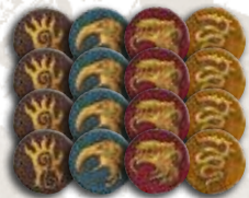
16 CLAN TOKENS (4 PER CLAN)