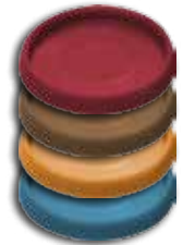
44 SMALL PLASTIC BASES (11 PER CLAN)