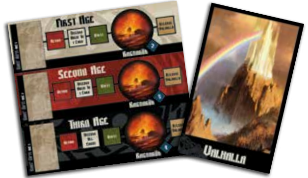
1 AGE TRACK SHEET